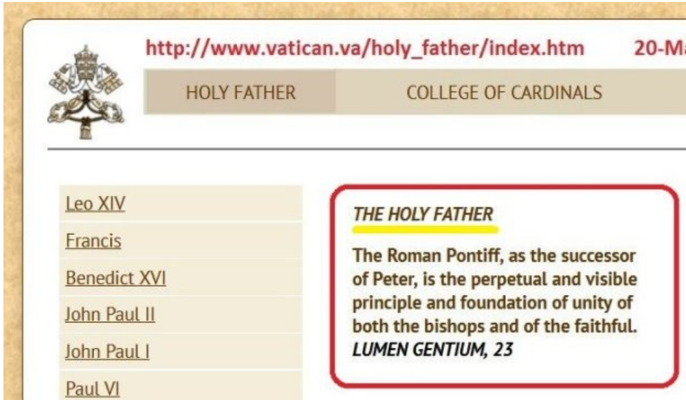
Image: Title “The Holy Father” on the Vatican’s official website (1) (The red and yellow highlighting is ours)